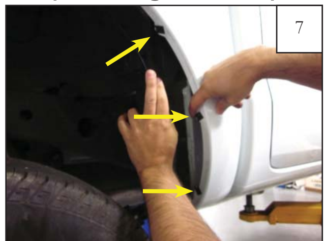
Using a #2 Phillips Screwdriver and or pry tool remove 6 pieces of factory hardware from the rear wheel well and discard. Note: Some vehicle models will have factory mudflaps. These will need to be removed for proper installation of flares.